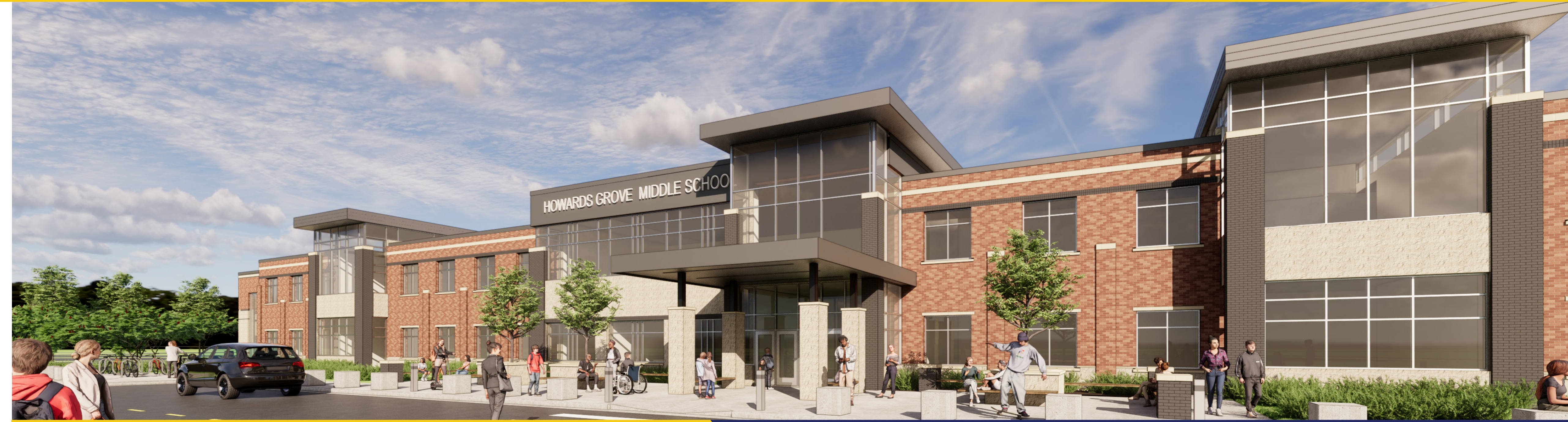
PROPOSED MIDDLE SCHOOL ADDITION TO HOWARDS GROVE HIGH SCHOOL

CONCEPTUAL RENDERING ONLY NOT FINAL DESIGN © 2022 PLUNKETT RAYSICH ARCHITECTS, LLP